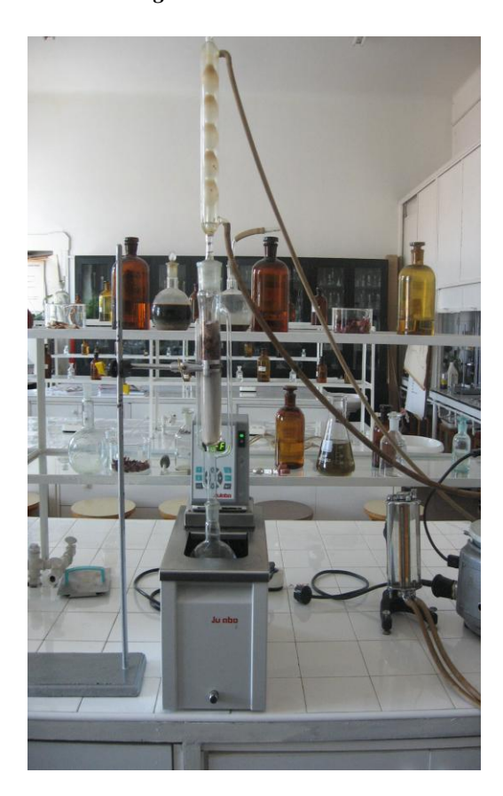
Fig. 2.2. Soxhlet device

The samples had a weight of 5 and 7 grams of seed. The results were expressed in percentages. The estimates regarding the economic efficiency were done by establishing the total expenses on hectare, the net profit and the rate of the profit.