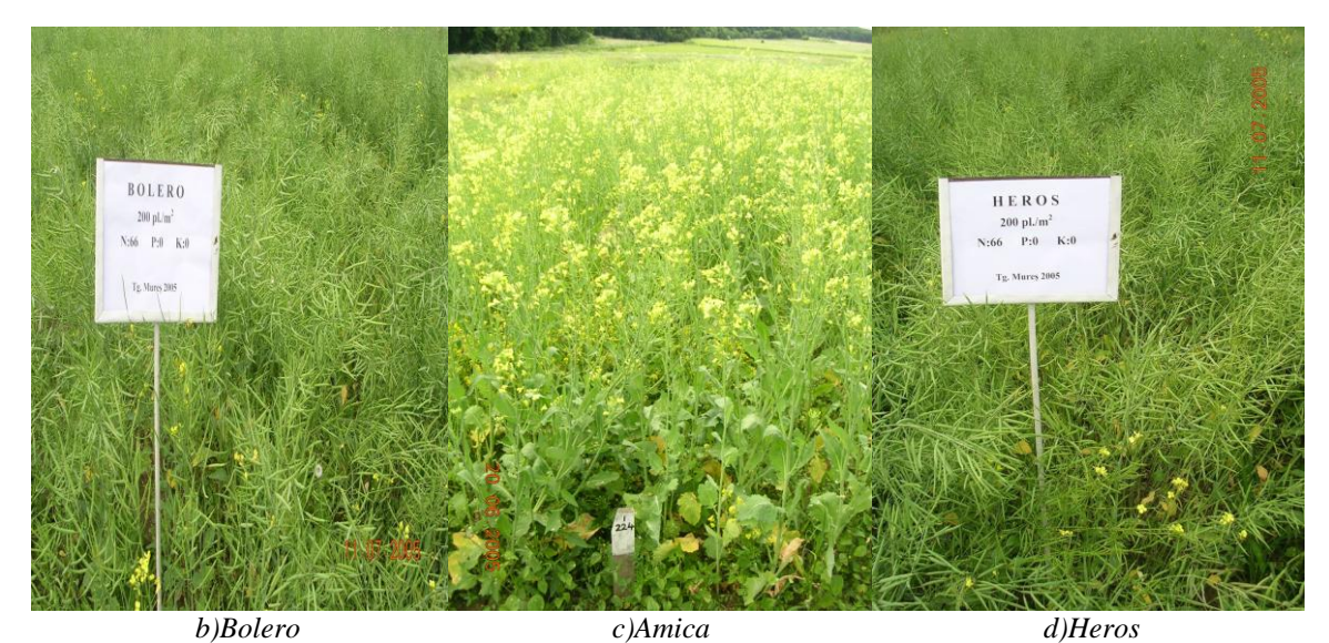
Fig. 2.1. Spring species.

In the laboratory was established the content of the oil of the seeds, through the Soxhlet method and through the nuclear magnetic resonance method, determined at the Newport analyzer instrument.