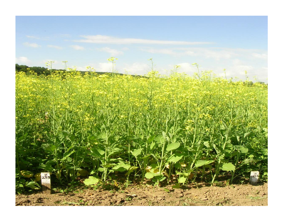
a) Field of rape

The analyses of the temperatures and rainfall in the years during which the experiment took place, in comparison with the multiannual average, shows that the agricultural years of 2005 and 2006 were more favorable for rape crops, than the years of 2006 – 2007 because of the pore rainfall. The type of soil on which the experiments were conducted was Luvosoil stagnogleizat.