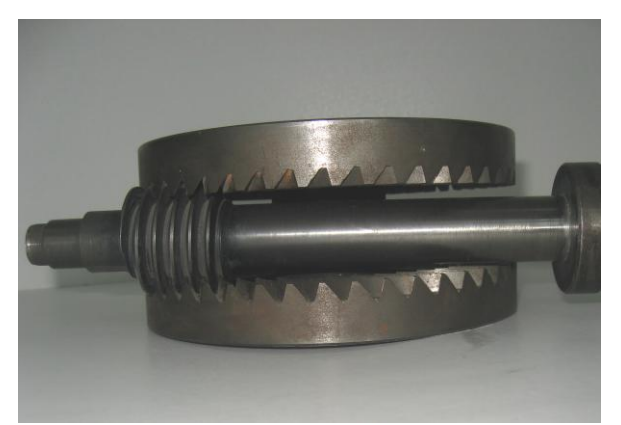
Fig. 4. Dual worm face gear with cylindrical pinion

This type of gear has some functional advantages of which some are required to be referred.