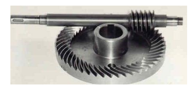
Fig. 1. Worm face gear with cylindrical pinion