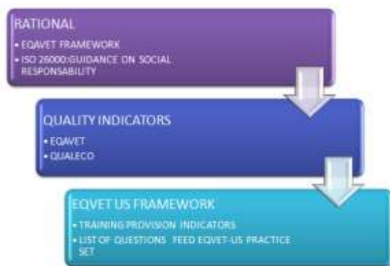
Fig. 1: eQvet-us framework conceptual model

eQvet-us quality framework establishes a series of indicators addressed at VET providers that have already QMS incorporated in their organizations and wishes to continually improve the effectiveness of the quality management system, through the establishment of quality indicators to monitor and promote their sustainable development. The conceptual model of the eQvet-us framework is presented in figure 1.